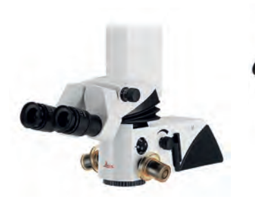
Variable binocular tube

A wide range of observation accessories meets all users' ergonomic requirements, offering the best possible view. The modular system allows a subsequent and straightforward upgrade.